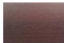
ABET 313 WENGUE