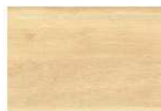
ABET 1611 SEI